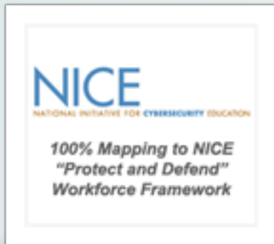
The National Initiative for Cybersecurity Education (NICE)