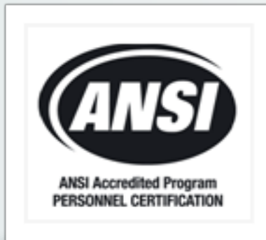
American National Standards Institute (ANSI)